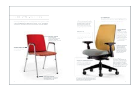
Page 22/23 Lively Side: Architex Tour Chili Seat, Geranium Tension Back, Metallic Silver Trim

Lively Side: Luna Odeon Astral Seat, Grass Tension Back, Metallic Silver Trim