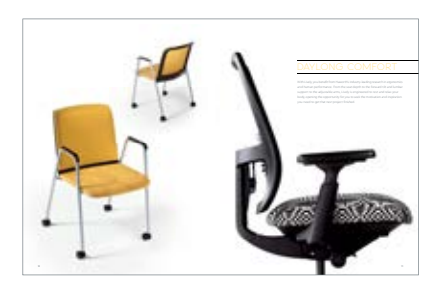
Page 10/11 Lively Side: Luna Dots Damask Miso Seat, Sunflower Tension Back, Metallic Silver Trim

Lively Task: Maharam Optik by Verner Panton White/Black Seat, Black Tension Back, Black Trim