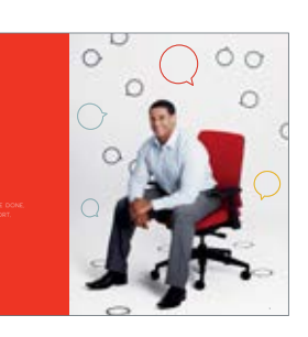
Lively Task: Maharam Metric Cardinal Seat and Back with Tomato Tension Back, Black Trim