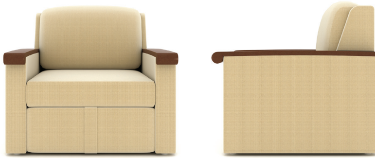
Sleeper Chair Pull-Out

The Archdale chair pull-out sleeper offers loved ones places to sit during the day and sleep at night.